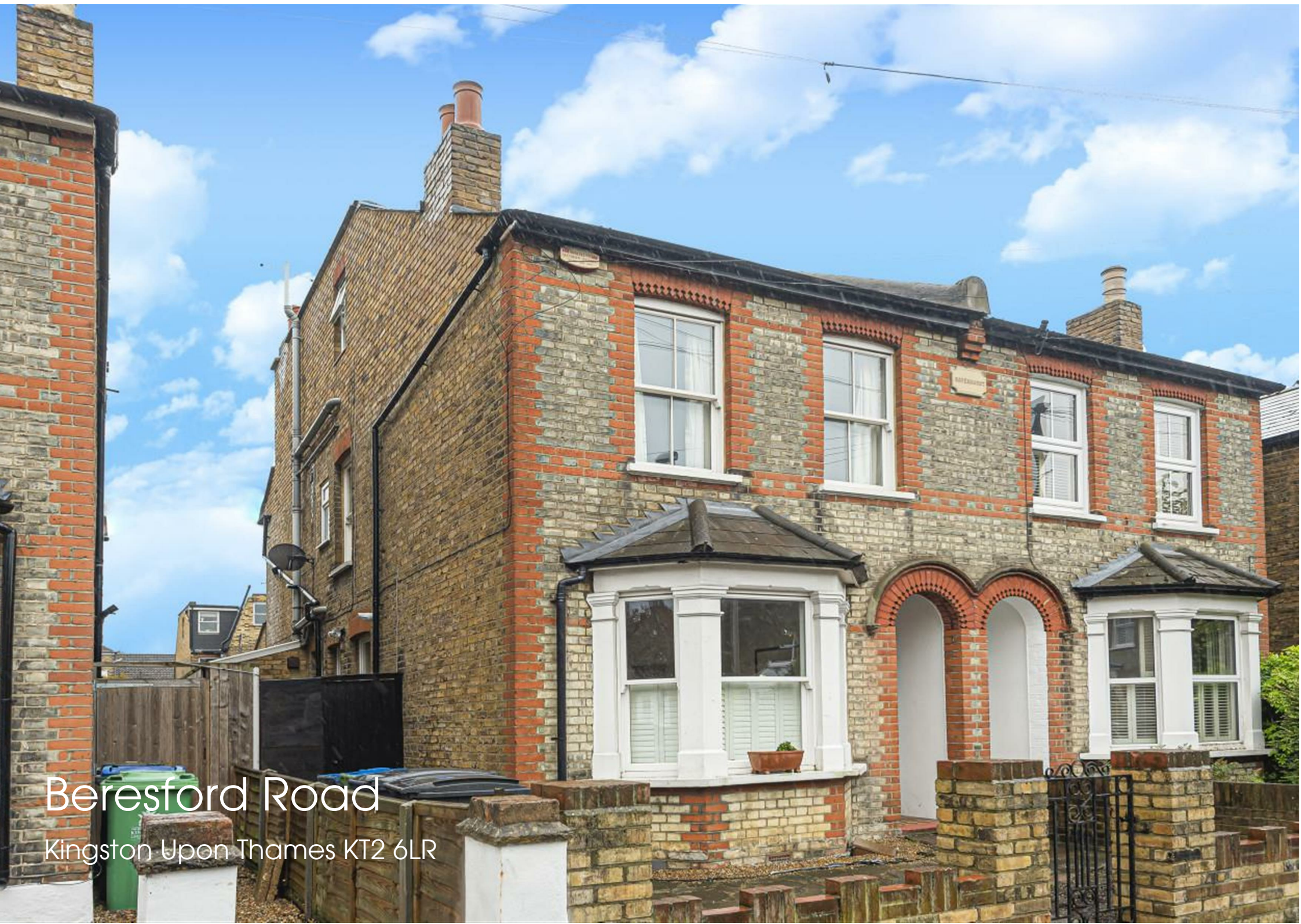
Beresford Road Kingston upon Thames KT2 6LR

34 Richmond Road Kingston upon Thames Surrey KT2 5ED www.gibsonlane.co.uk Tel: 020 8546 5444